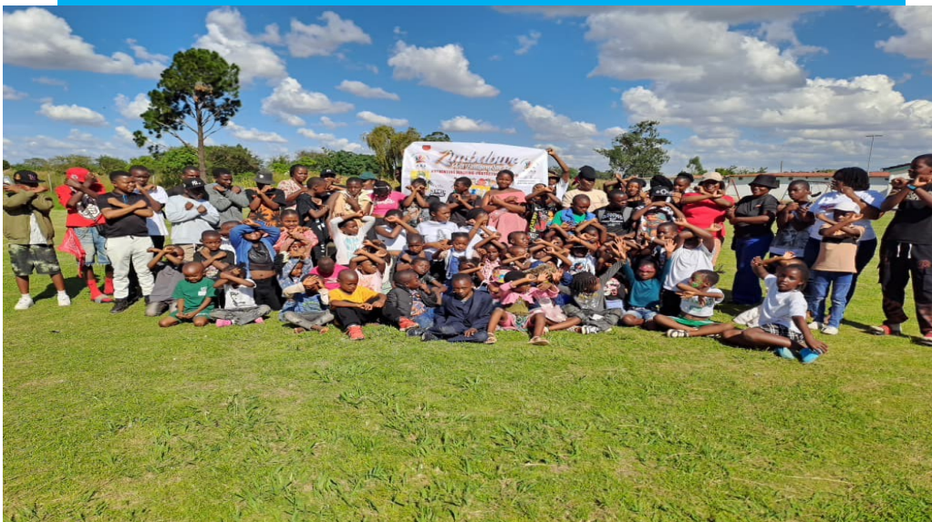
Schools Anti Bullying Workshop Feb 2026 for teachers and community leaders

40 boys attended the event and they brought their tool boxes as the topics included bullying, drug and alcohol abuse, entrepreneurship, the boy and his legacy among other topics. The objective of this two day workshop was to empower the boy child.