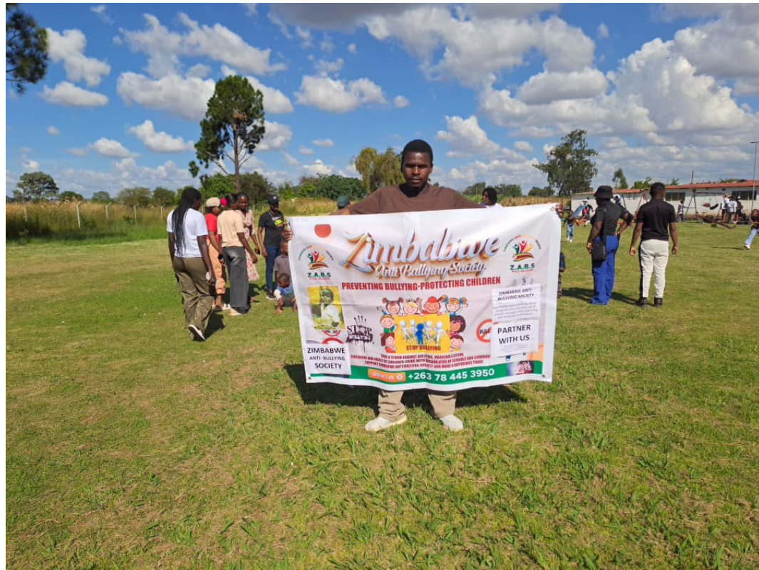
The message was loud and clear...preventing bullying, protecting children

Mental health impact on victims, especially learners with disabilities